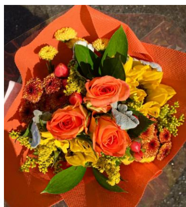
Pre-order your Recital Bouquets no later than May 15, 2025